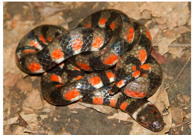
Fig. 1. Hydrops triangularis (MUSA 4749) collected at Pampas del Heath National Sanctuary, Madre de Dios region, Peru.