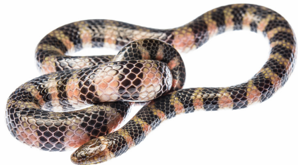
Fig. 2. Hydrops triangularis (photographic voucher Nbr. PERU2016_5732) recorded at Los Amigos Biological Station, Madre de Dios, Peru.